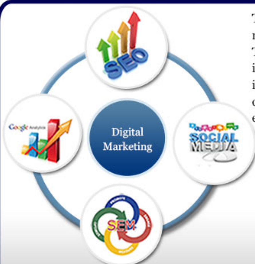
Digital Marketing Services by Saviance

The education sector is a completely revolutionized sector since the majority of the population of students are the users of the internet. This has a direct implication on the fact that educational institutions and universities need to make increased use of the internet and mobile devices to reach out to more students. And digital marketing is the best method that can be adopted by the educational institutions to reach out to prospective students.