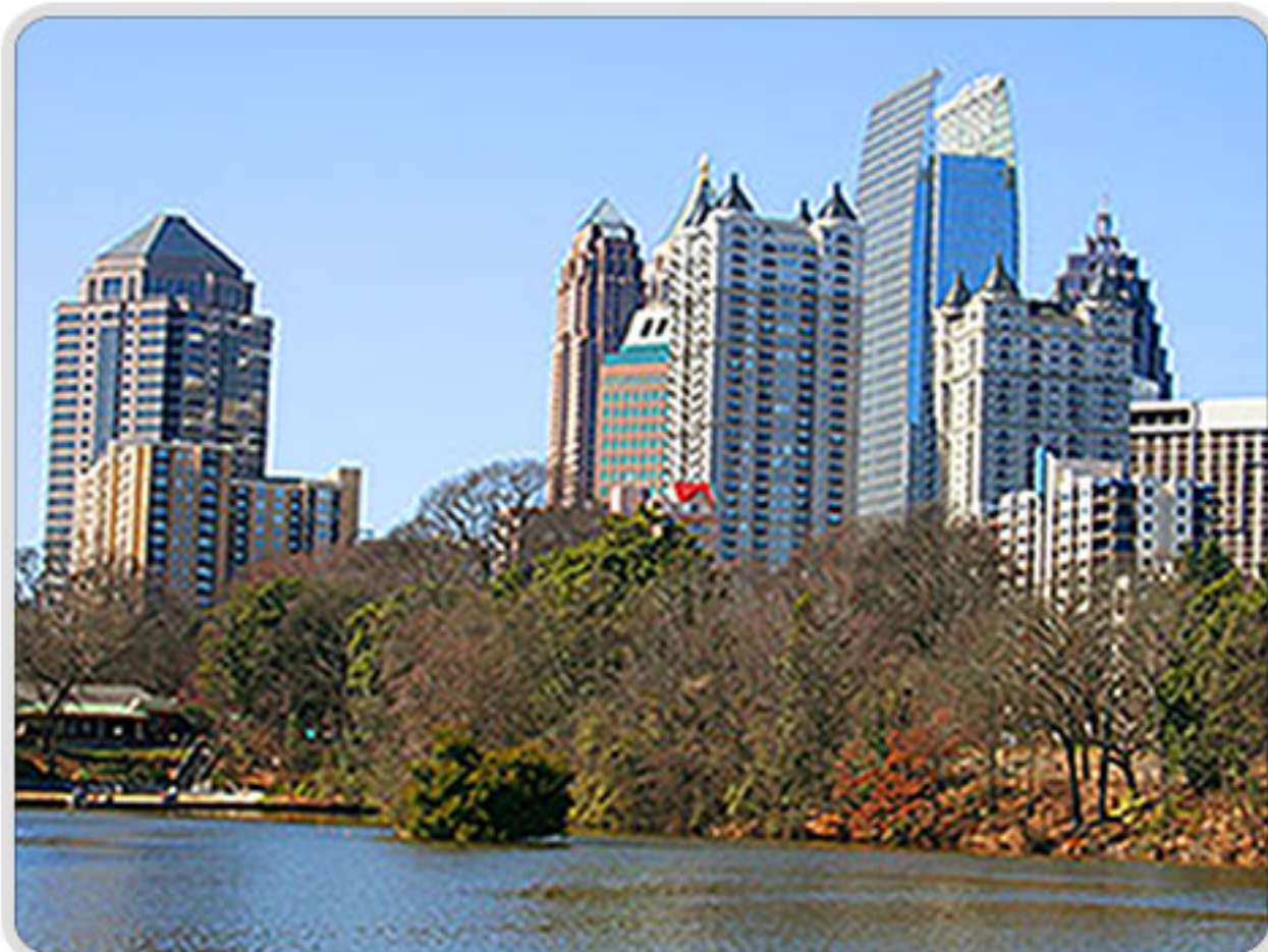
Saviance opens its Atlanta Office