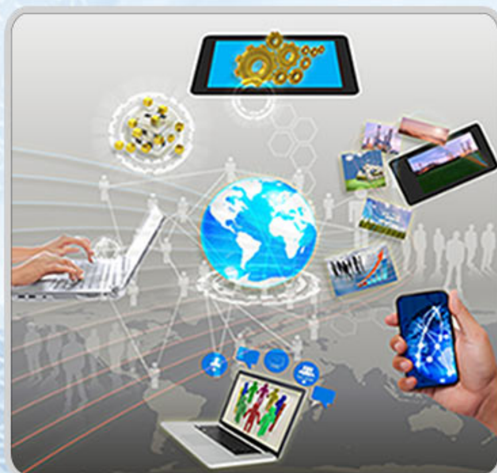
Enterprise Mobility at Saviance

There are however a few challenges that enterprise mobility faces. This is because users select devices, install their apps, and work when and where they please. In general, results are positive, but many dangers lurk with this freedom. Many measures are needed to ensure security while allowing mobility to enhance productivity.