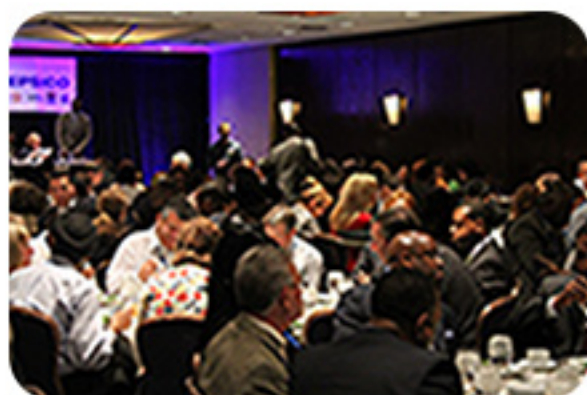
Saviance at the NSMDC Business Opportunities Expo 2013

Saviance is the Annual MBE Partner Sponsor for the Business Opportunities Expo 2013 that was held on 19th-20th June 2013 at New York Marriot Marquis. This year marks the 40th year of The Council and the Expo's theme, The Minority-Majority: