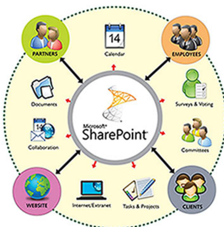
Saviance is a Microsoft Certified Partner